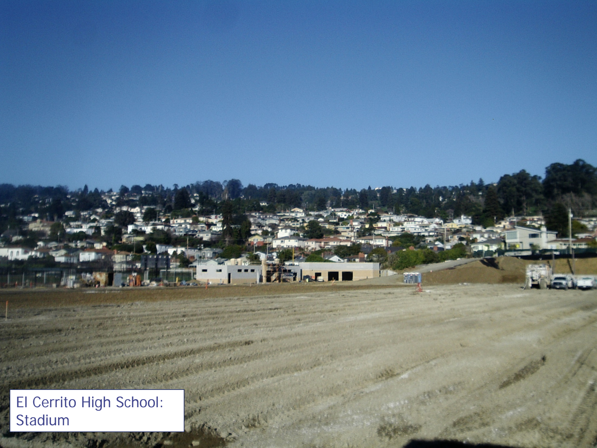
El Cerrito High School: Stadium