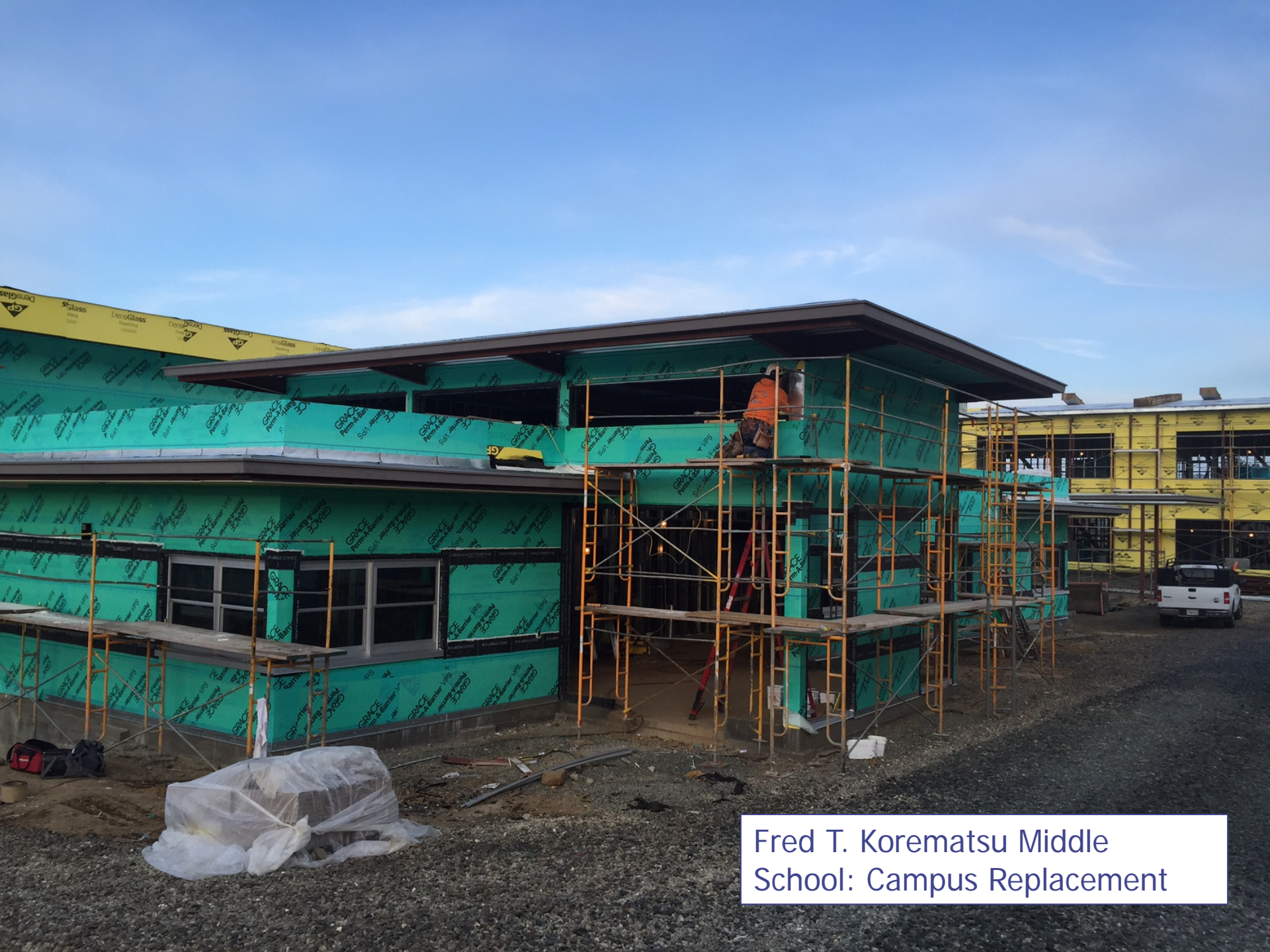
Fred T. Korematsu Middle School: Campus Replacement