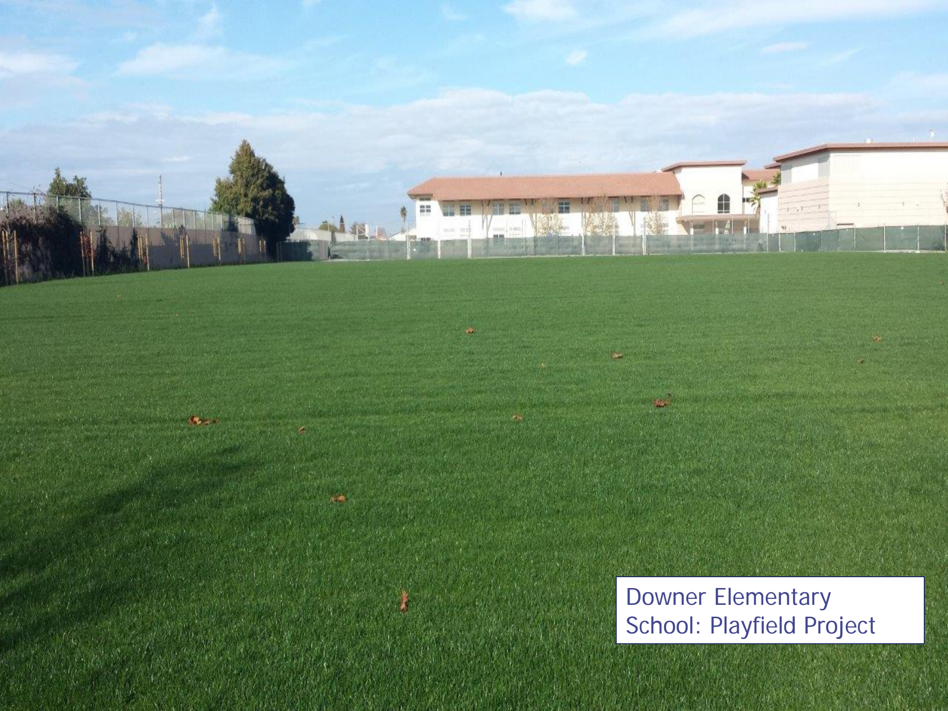
Downer Elementary School: Playfield Project