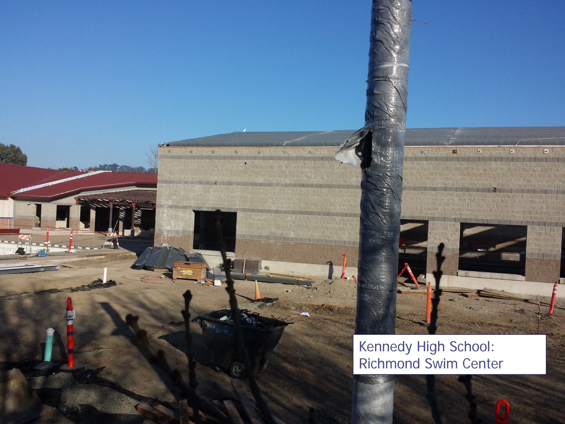
Kennedy High School: Richmond Swim Center