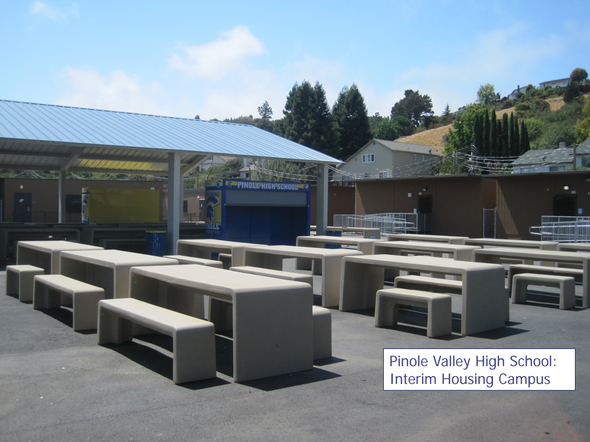
Pinole Valley High School: Interim Housing Campus