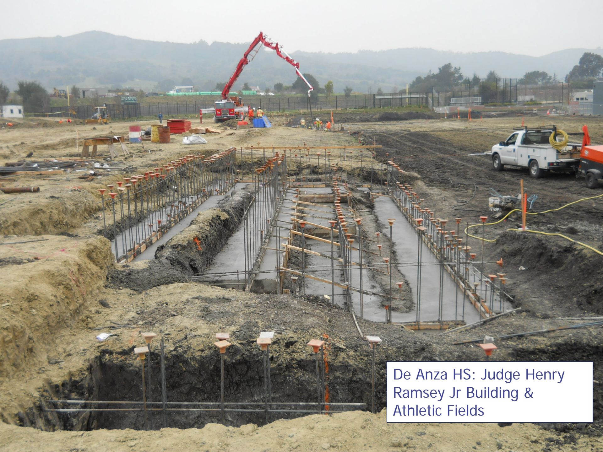
De Anza HS: Judge Henry Ramsey Jr Building & Athletic Fields