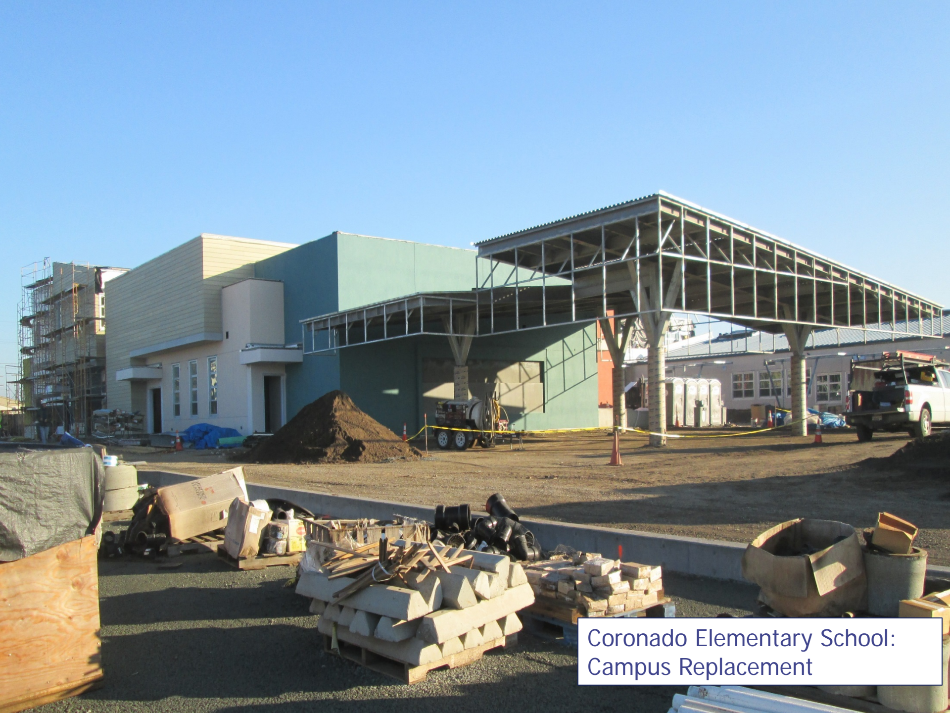
Coronado Elementary School: Campus Replacement