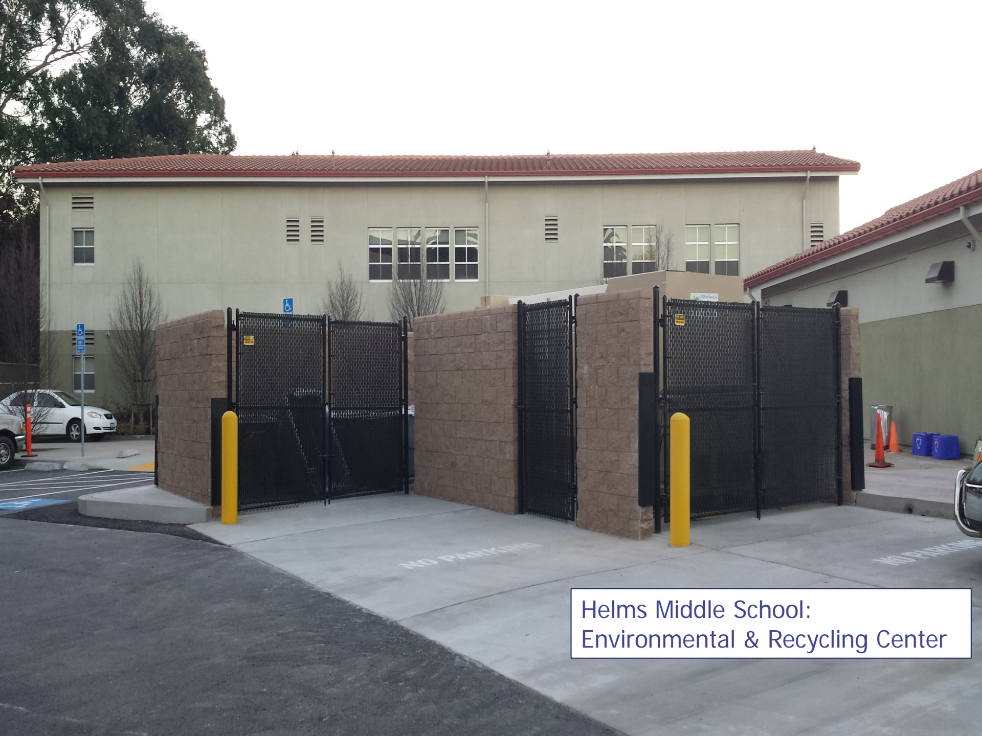
Helms Middle School: Environmental & Recycling Center