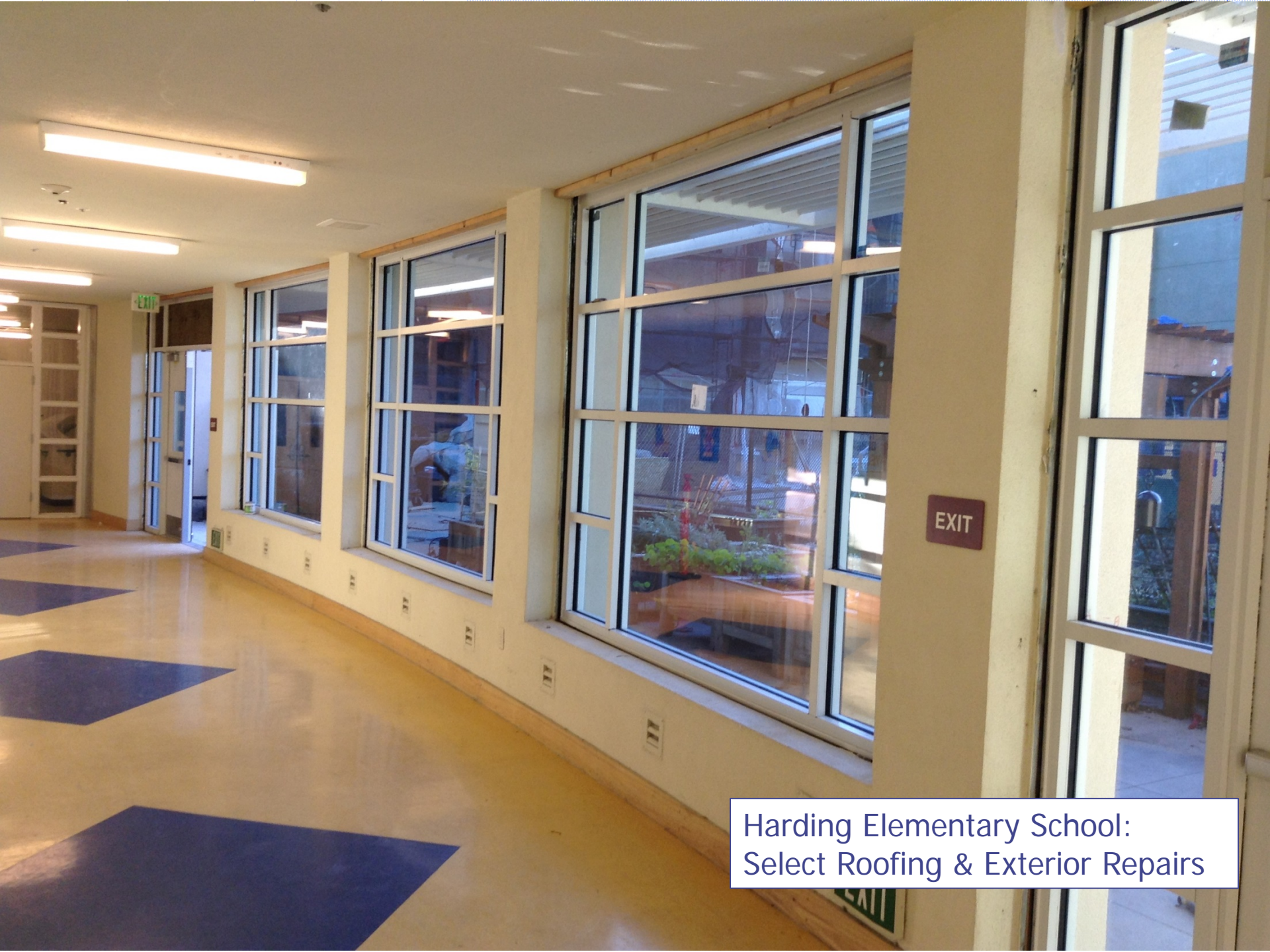
Harding Elementary School: Select Roofing & Exterior Repairs