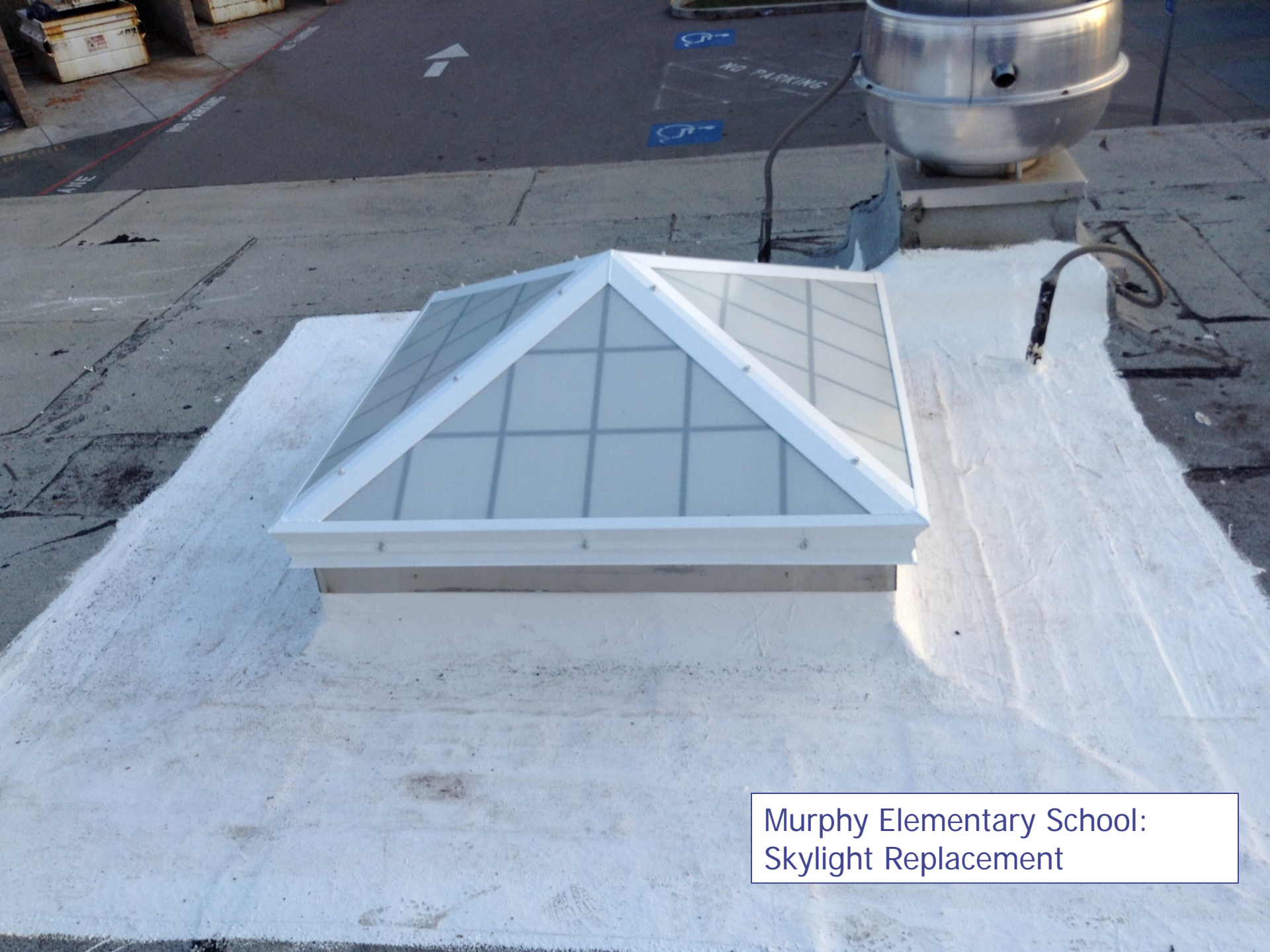
Murphy Elementary School: Skylight Replacement