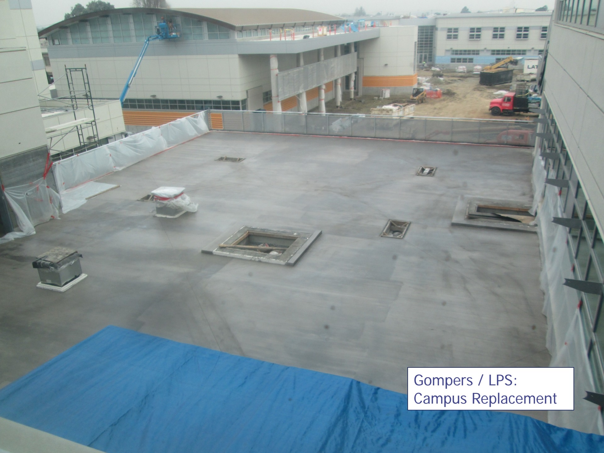
Gompers / LPS: Campus Replacement