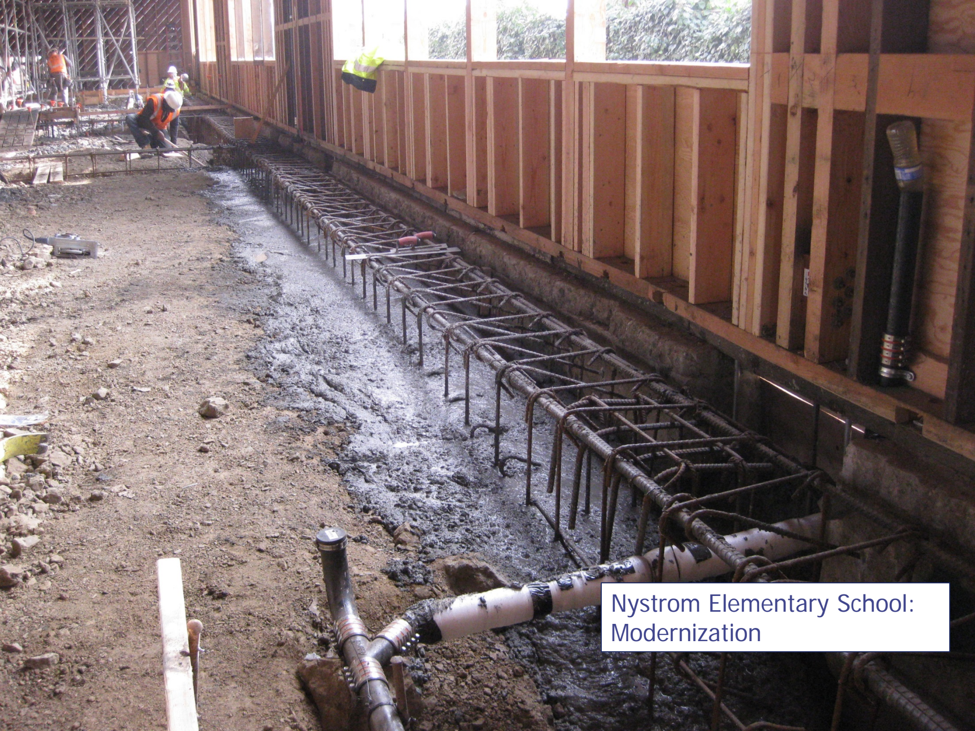
Nystrom Elementary School: Modernization