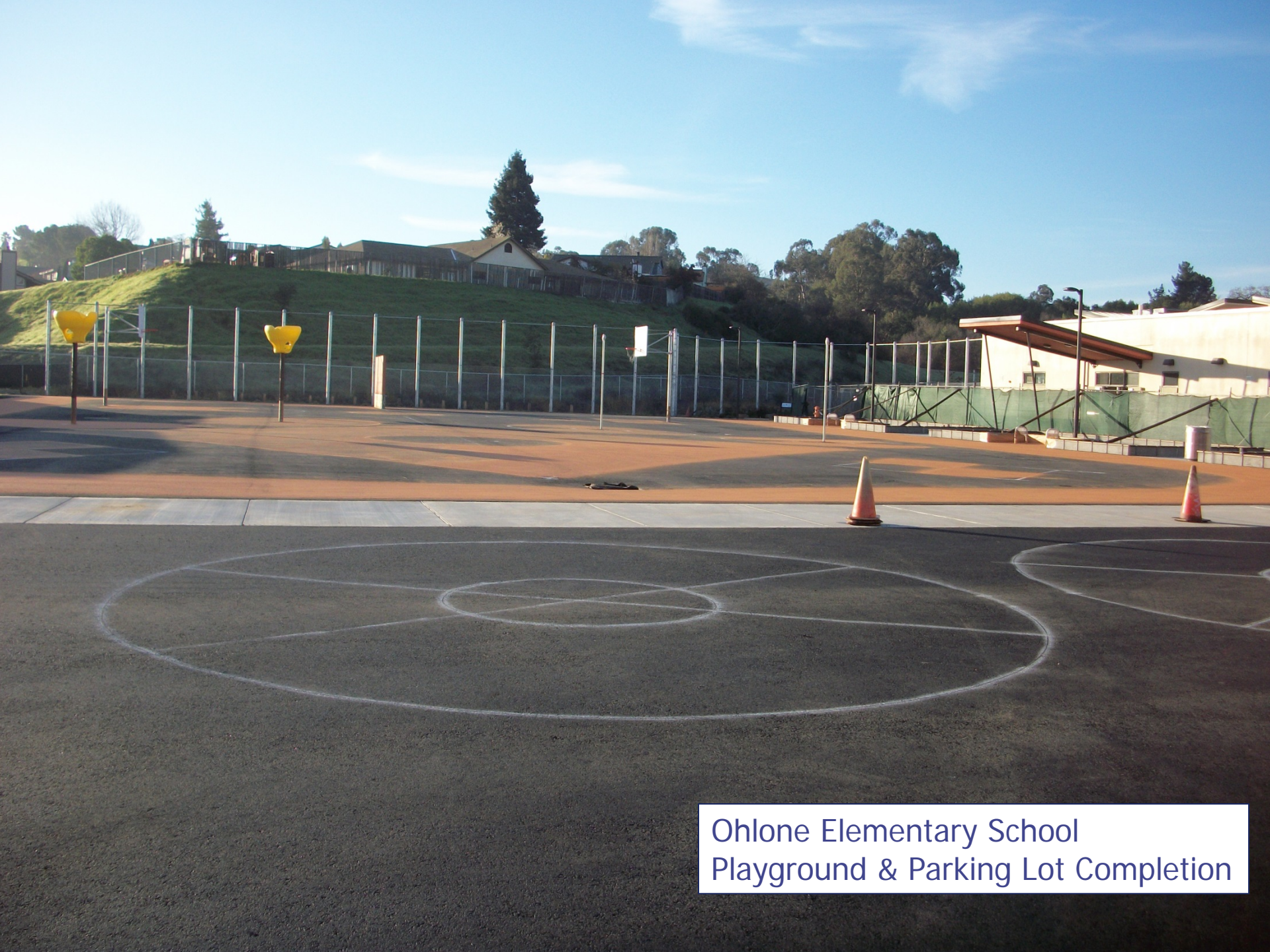
Ohlone Elementary School Playground & Parking Lot Completion