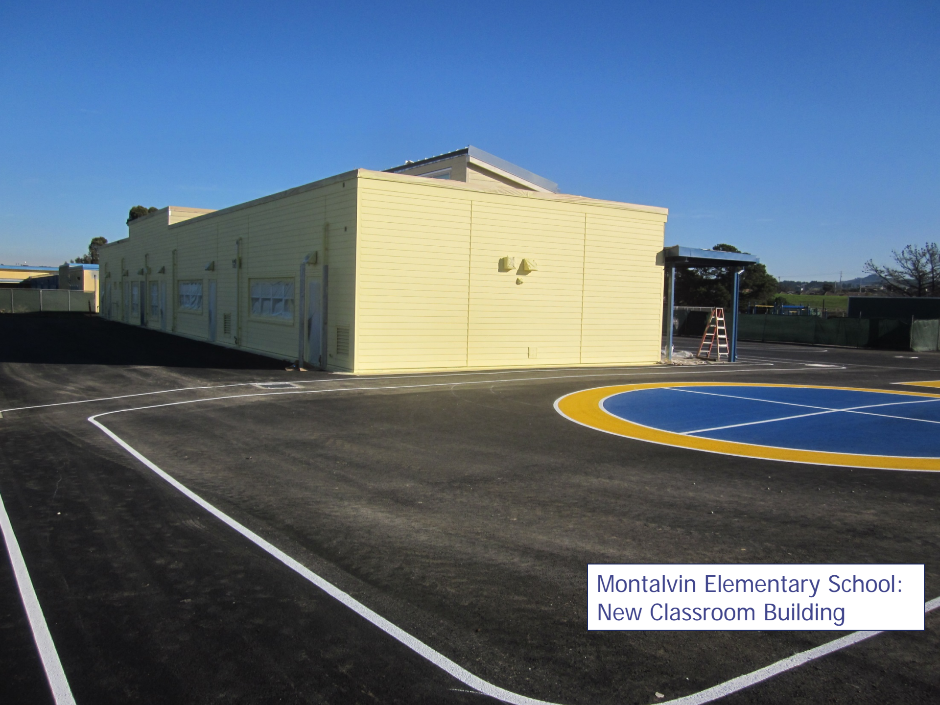
Montalvin Elementary School: New Classroom Building