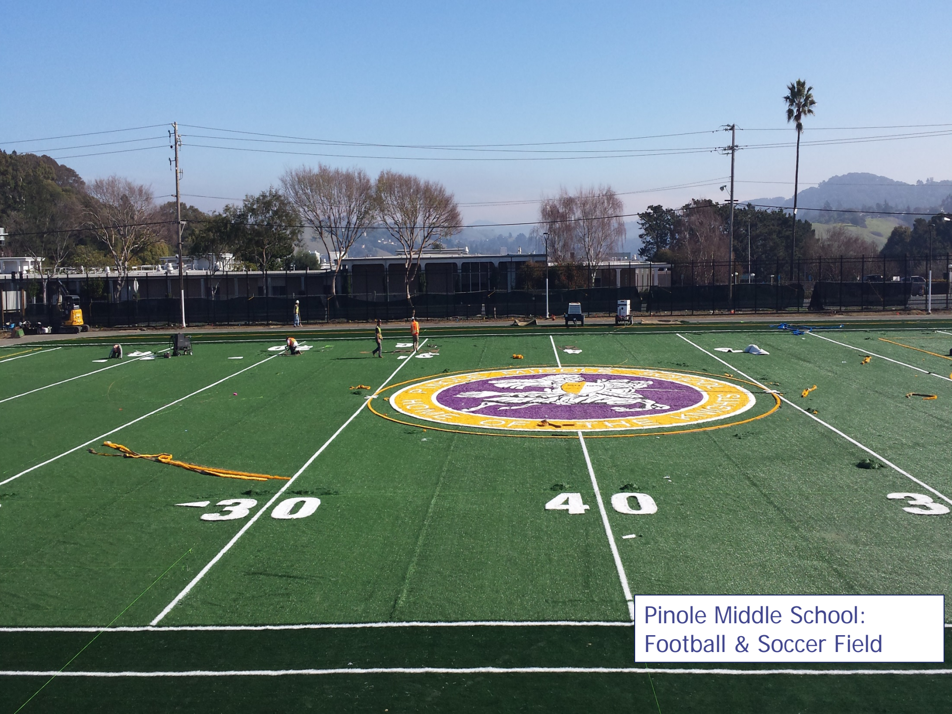
Pinole Middle School: Football & Soccer Field